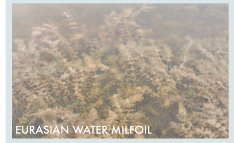
EURASIAN WATER MILFOIL