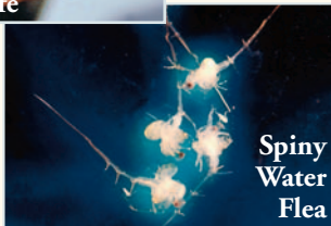
Spiny Water Flea